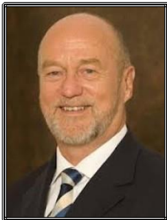
Mr Derek Hanekom, Minister of Science & Technology