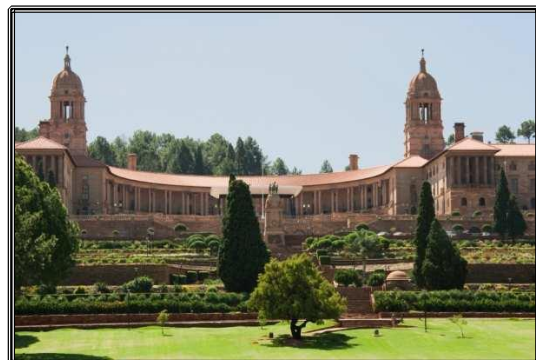
The Union buildings, Pretoria

SAIT, PO Box 1240, Kelvin, 2054 South Africa Tel: +27 11 804-3710 Fax: +27 86 19-2261 e-mail: secretary@sait.org.za and admin@sait.org.za Website: www.sait.org.za