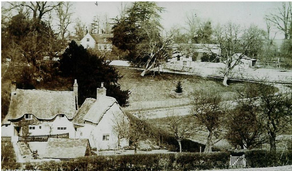
"Whitegates" is the name given to the 2 cottages in the lower left corner of this postcard view of circa 1910.