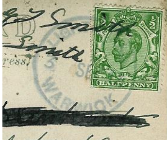
Lighthorne postmark, 1913.