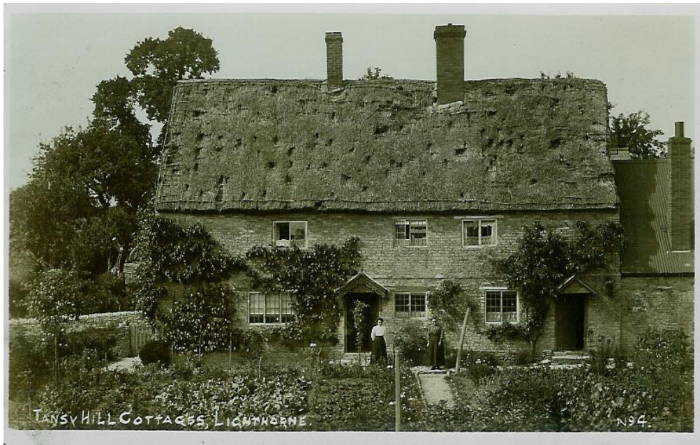
The Old Schoolhouse, referred to on this circa 1910 postcard as “Tansy Hill Cottages”. The thatch was in a poor state.

The Old Schoolhouse is built of square coursed limestone with string courses. It became a single residence in the 1980s, when it was re-roofed with old tiles, replacing a mix of thatch and corrugated iron. The whole building now has leaded light windows which are either the originals repaired or replacements.