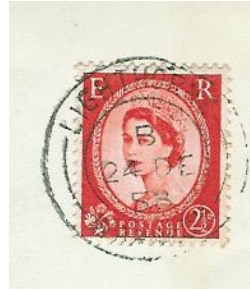
Lighthorne postmark, 1953.