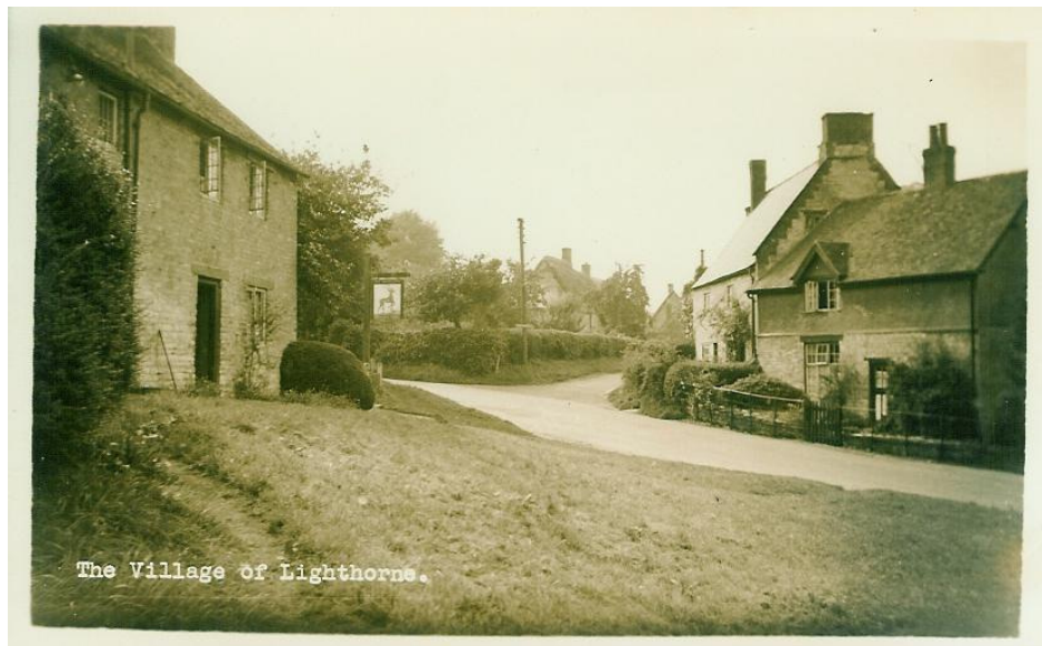
Part of the Malthouse with “Lattimer’s Cottages” opposite on a 1950s postcard.

Adjacent to the pub is the malt house, probably built in the early nineteenth century, converted to domestic use in the 1980s, although census records indicate that it had included staff apartments in the nineteenth century. It was in use as a village hall, youth group venue and drama group venue before the Village Hall was built in 1960. The September 10 th 1929 auction catalogue records that it was let to the Lighthorne Harmonic Society at a rent of £5 per annum and that it was equipped with electric light.