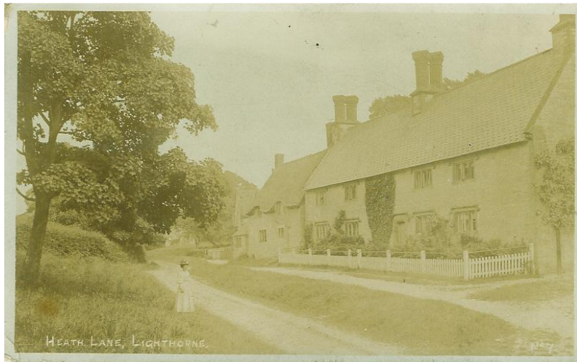
Dene Hollow on a postcard circa 1910. Heath Lane is now known as Old School Lane.

This is a late 16 th century or early 17 th century house of regular coursed limestone, with contrasting ironstone dressings and alternating quoins. It has been recently re-slatted and the original stone coped gable parapets with moulded kneelers have been retained. The front door is nineteenth century. It has a moulded basket arched surround with moulded spandrels and hood mould with lozenge stops. The house has 3 light recess-chamfered stone mullioned windows with hood moulds. The chimney stacks have quoins and brick dog-tooth cornices.