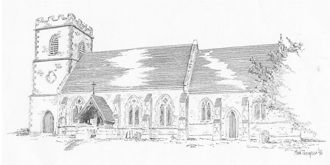
St Laurence's Church

The Hwicce were an Anglian tribe who arrived in this area around 577 AD. Christianity was introduced to Lighthorne in 688 AD, when King Eanhere of the Hwicce became a Christian. The Diocese of Worcester was formed from the Kingdom of the Hwicce.