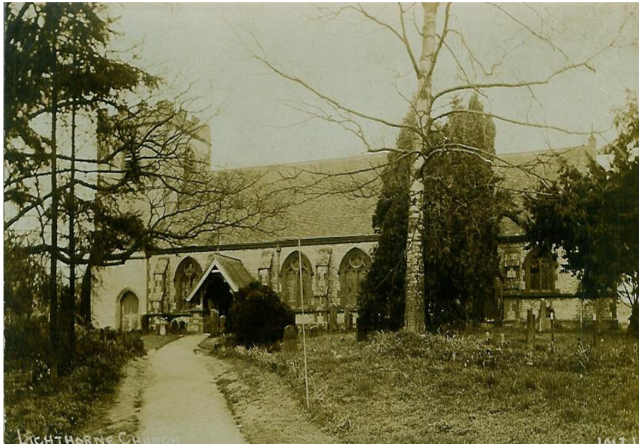
St. Laurence's Church on a postcard circa 1910.