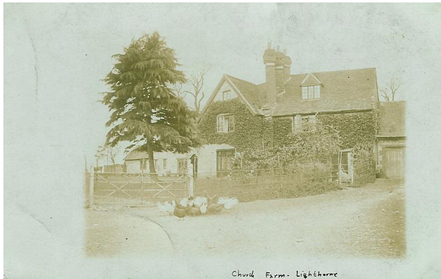
Circa 1905 postcard view of Church Hill Farm.

Church Hill Farm is probably the oldest domestic building in the village. Part of it dates back to the early to mid sixteenth century, with extensions in the early to mid seventeenth century and a late seventeenth century wing set back at an angle, to the right. There is an early to mid nineteenth century attached stable range to the right, altered and converted in the late 20 th century.