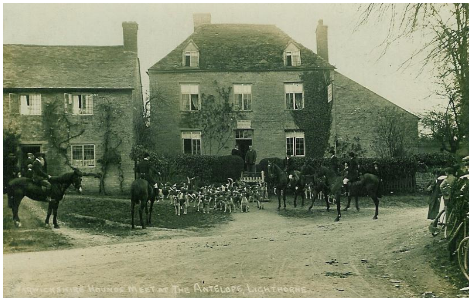
Meet of the Warwickshire Hounds at the Antelope, circa 1910.

The building is thought to date from the early 18 th century. It is built of squared coursed limestone with an old tile hipped roof. It has an L plan, with a wing on the right to the rear. Photographs, taken around 1910, show that the pub used to have a door in the centre of the front elevation. To the left of the door was part of the domestic accommodation, the bar being to the right. There was a hallway between the two. The lean to building on the right, with a pitched roof, apparent in the early postcards, was a manger which also served as a laying out room for the dead. This lean to building was replaced with a flat roofed porch in the 20 th century. The porch and doorway which form the current entrance are mid to late 20 th century and the well is a 1990s decorative feature.