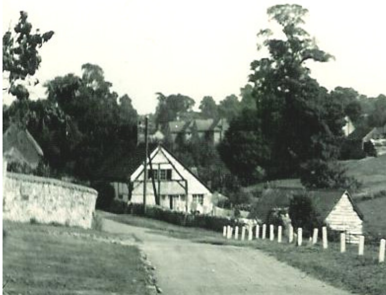
Fairfield in the 1950s.

This house dates from the early to mid 17 th century. It has been substantially extended twice in the 20 th and 21 st centuries. The original structure is timber framed with whitewashed brick infill. It sits on a base of whitewashed brick. The roof is late 20 th century tiles and would originally have been thatched.