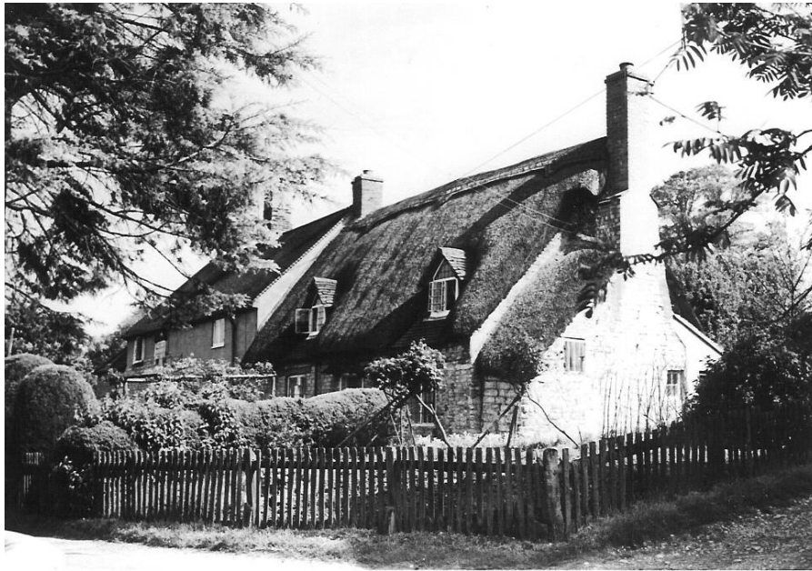
Yew Tree Cottage in the 1960s.

Dated 1632, on the front wall, it is built of squared coursed limestone, with a large inglenook fireplace. It is one of only two cottages in Lighthorne which have retained their thatched roofs. The extension to the right is a 20 th century addition.