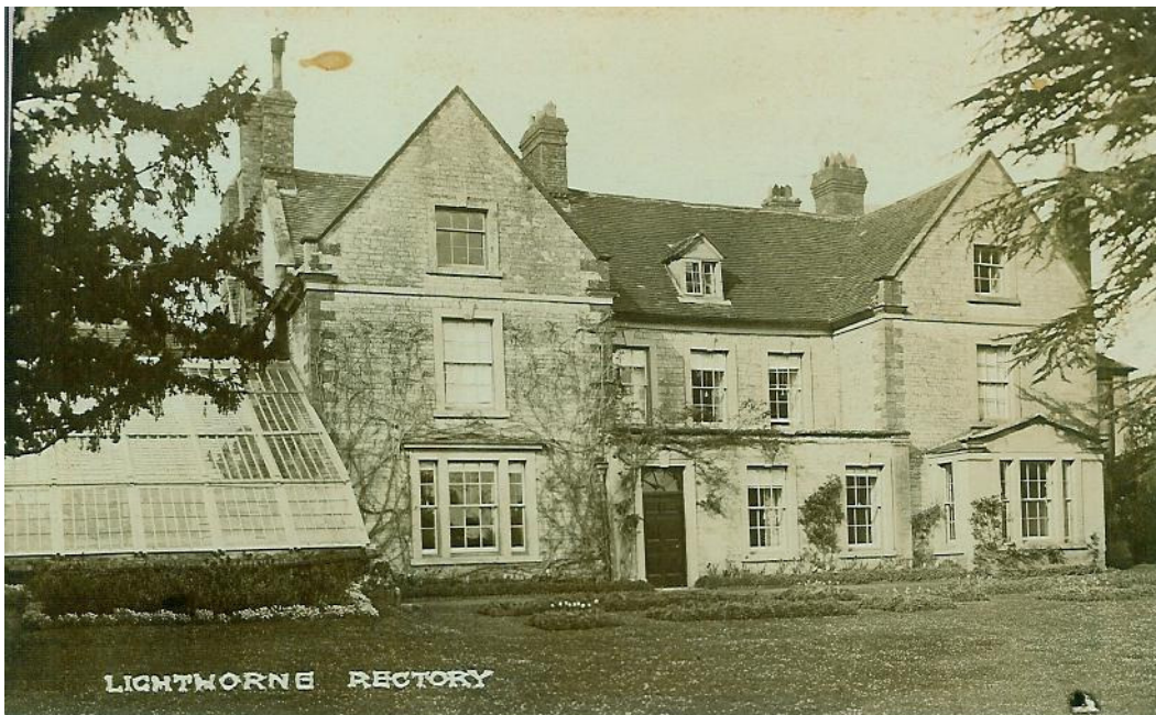
The Old Rectory on a circa 1910 postcard.