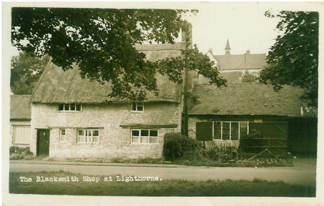
The smithy on a 1950s postcard.