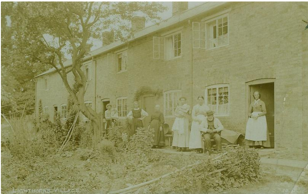
Numbers 1 – 6 Bank Cottages on a circa 1910 postcard.

At the west end of The Bank, on the site of the present houses “Larkins” and “Stoneybank”, stood two terraces of brick-built cottages, in line and with a small separation between the two terraces. In style they were similar to “South View” before it received its 20 th and 21 st century additions. They were built of bricks, probably made at the Chesterton Hill estate yard, and had slate roofs. In the two 1929 Compton Verney estate auctions the cottages were offered as a block of 6, a block of 4 with estate store adjoining and a semi-detached cottage at the eastern end. None of the 3 lots sold and in the 1930 auction the cottages were individually lotted, the western block listed as 6 two bedroom cottages and the eastern block listed as 4 two bedroom cottages and 1 double cottage of four bedrooms. The implication is that the estate store had been turned into a 2 bedroom cottage. The semi-detached cottage on the eastern end was lotted separately. Unfortunately the two terraces were demolished in the early 1970s.