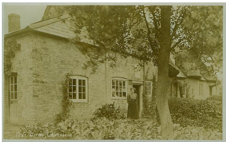
The Post Office, circa 1910

This cottage is stone built and the western part, which probably dates from the 17 th or 18 th century, was originally thatched. It retained its thatch to at least 1937, as it features on a postcard used in that year. The eastern end was a slate-roofed lean to attachment, which has been extended vertically in the 20 th century.