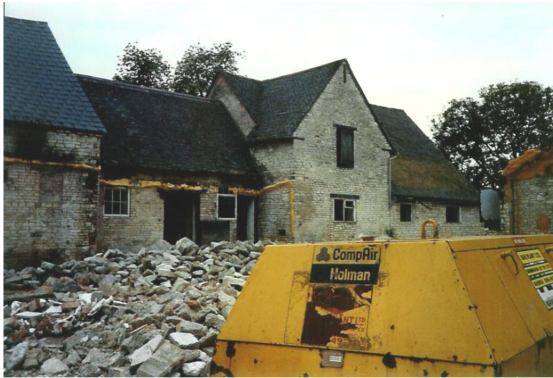
Church Hill Farm barns were converted into houses in 1989.